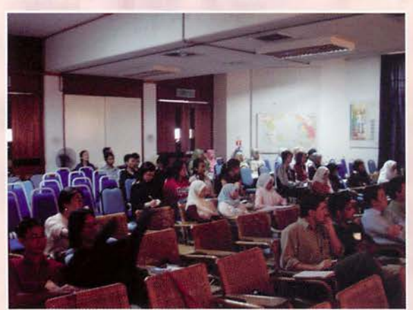
Participants taking keen interest in each talk presented.