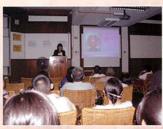
Elaborating a point on asterism on a star ruby.