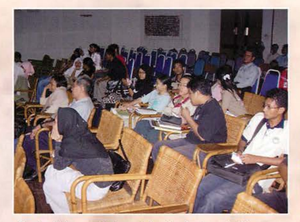
Part of the participants in the lecture hall.