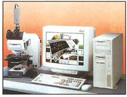
Leica Imaging Stations