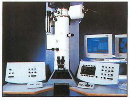
LEO EF TEM