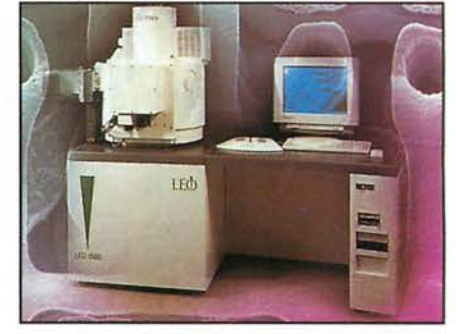
LEO FE SEM