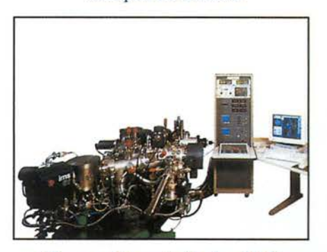
Cameca Magnetic Sector SIMS