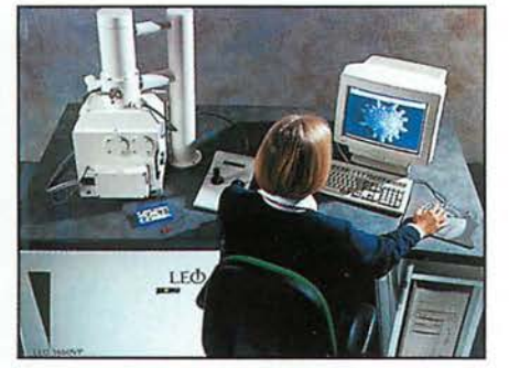
LEO VP SEM